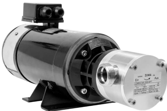
COMBISTAR 2000-B 12V with pump carrier