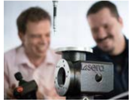
Long-lasting products and high quality

We always respond flexibly to your requirements and process and handle everything quickly and reliably. From engineering to production, through to after-sales service, we provide high-quality products and services.